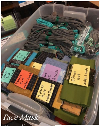
Face Mask Supplies