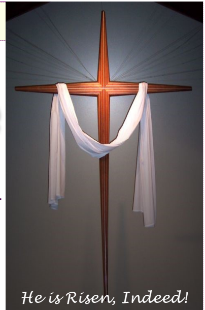
He is Risen, Indeed!